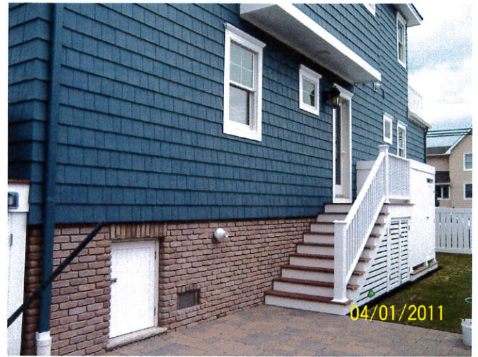
Front View – Date of Photograph: (See Photo Stamp)